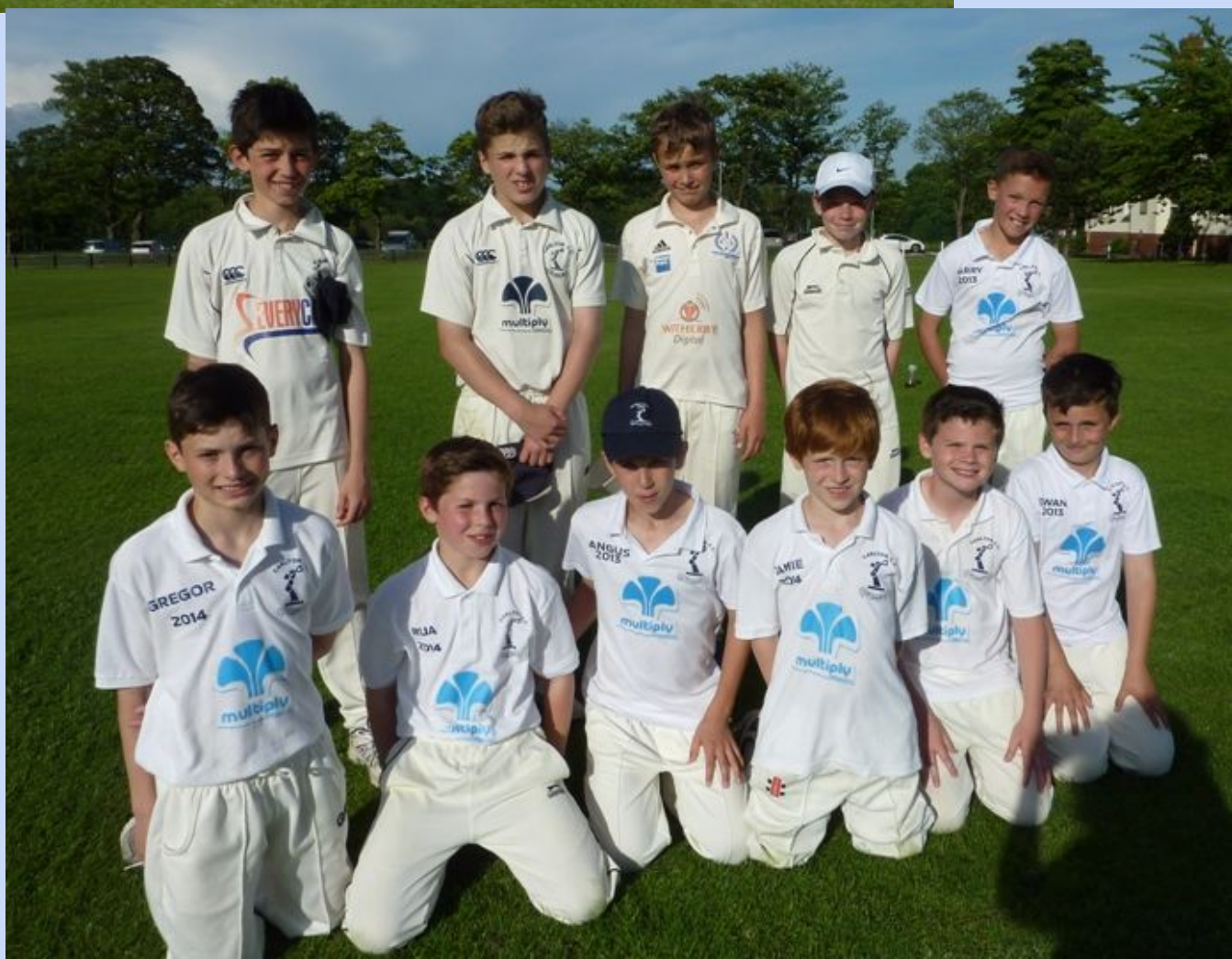
Carlton Primary XI