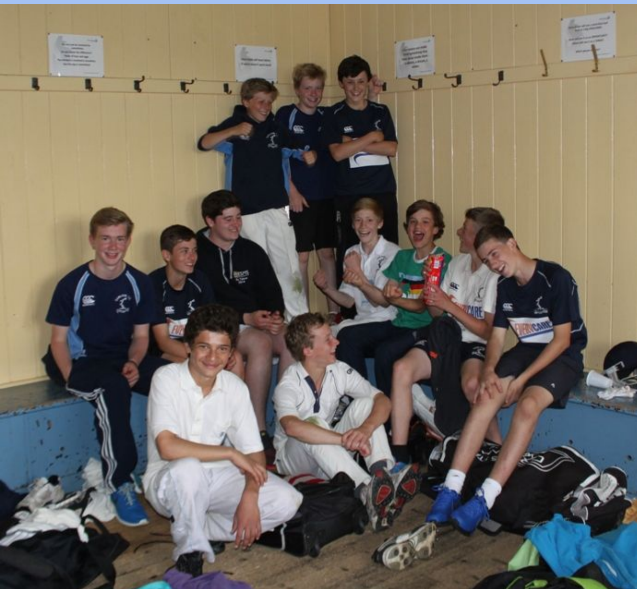
Carlton u15 - celebrate winning the ECB Cup