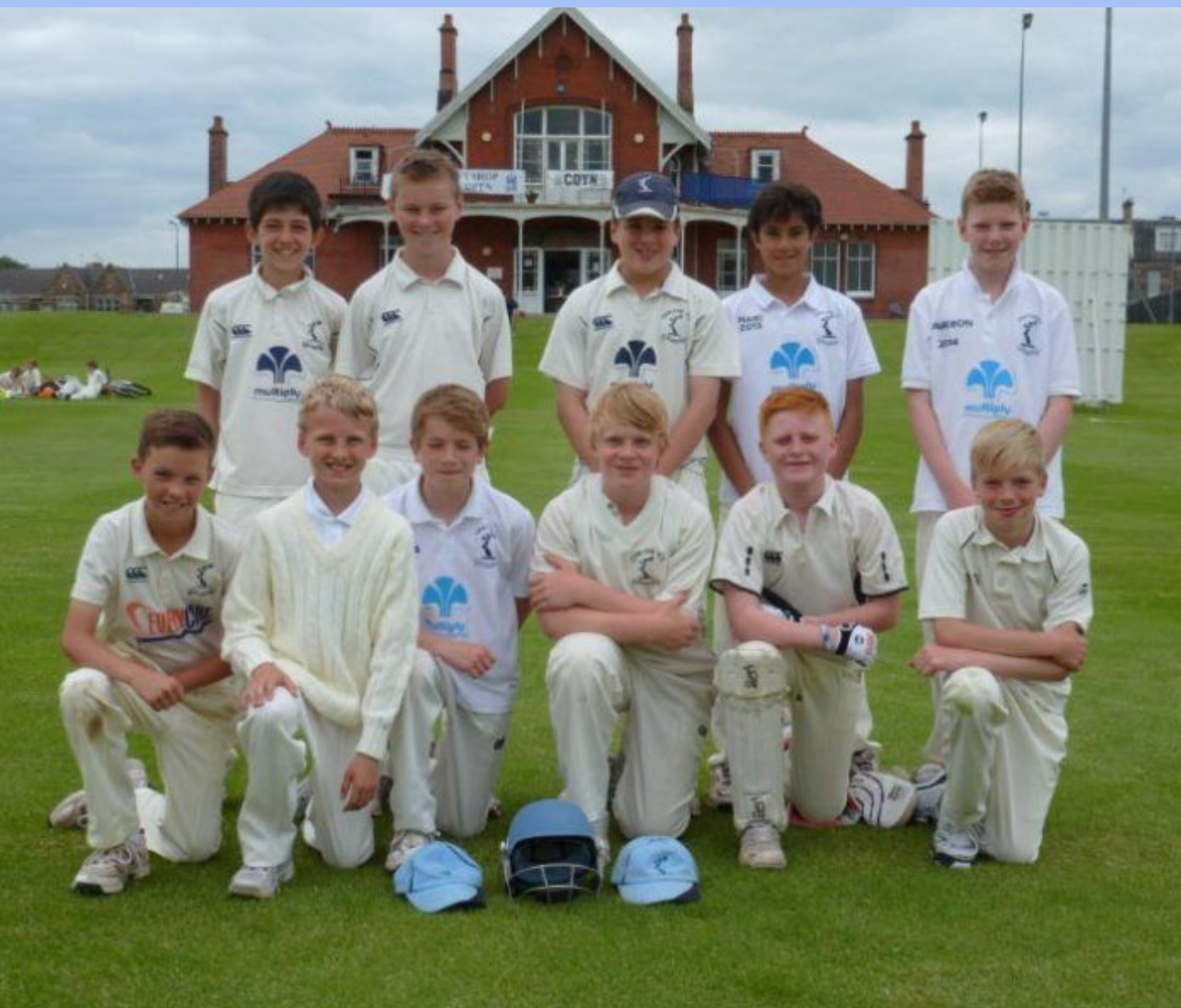
Carlton u13 - runners up in the ECB Cup