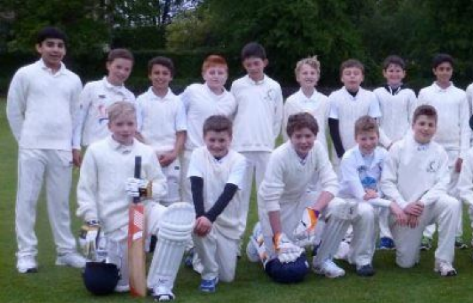
The full u13 squad of 2014 pictured at an end of season intra club match