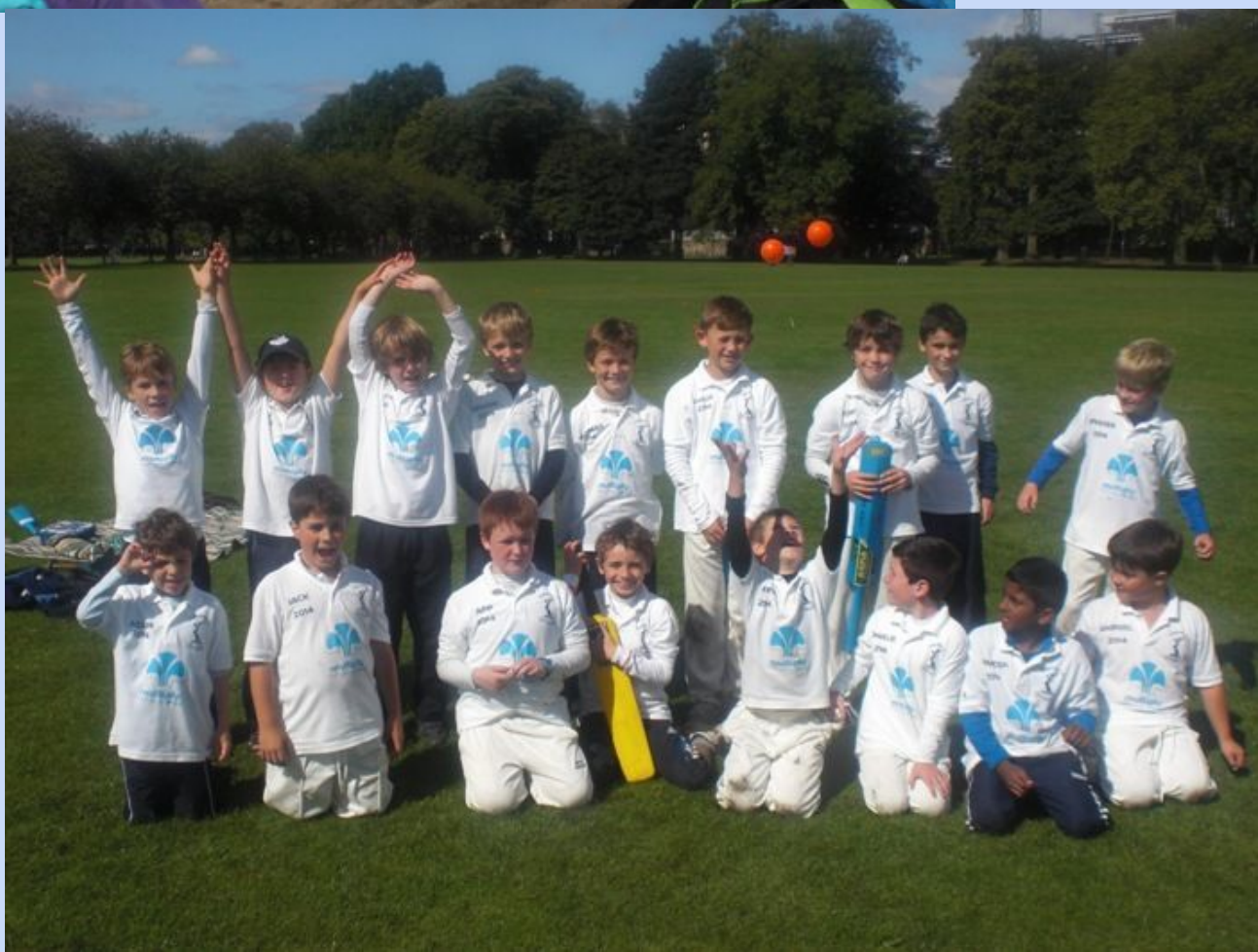
Carlton Kwik Cricketers