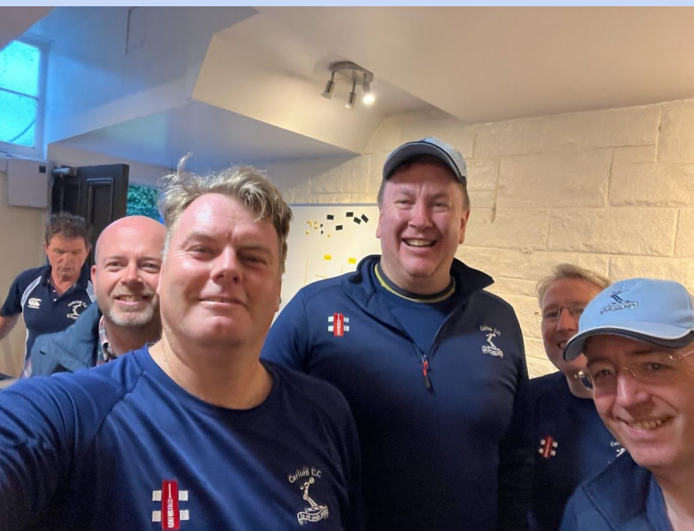
Looking younger every day.....