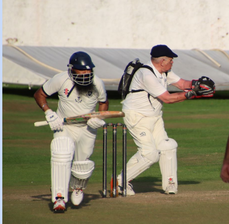
Photos - above in action at GL; below left - a stumping turned down at GL; below in his prime for Forfarshire

Alex most recent previous visit to Grange Loan was in 1988 when he opened the batting for Forfarshire and scored 22. Prior to that he had played six other times at Grange Loan with a highest score of 56* in 1988. Forfarshire were victorious on both occasions.