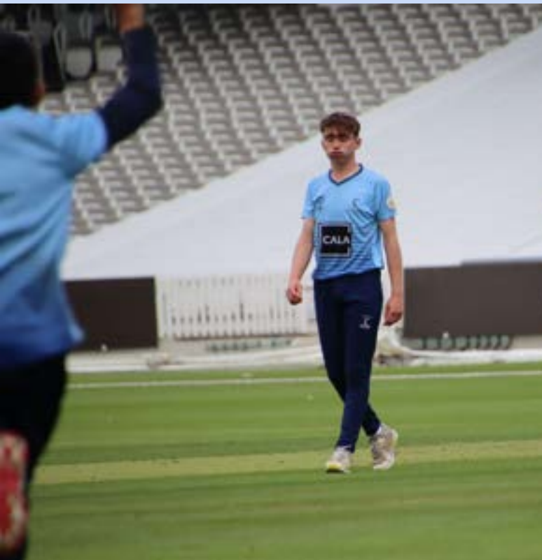
Relief for the skipper.....joy in the field

Utter relief!! I can't really remember very much. I was in a bit of daze. I do remember the others jumping around and hugging each other.