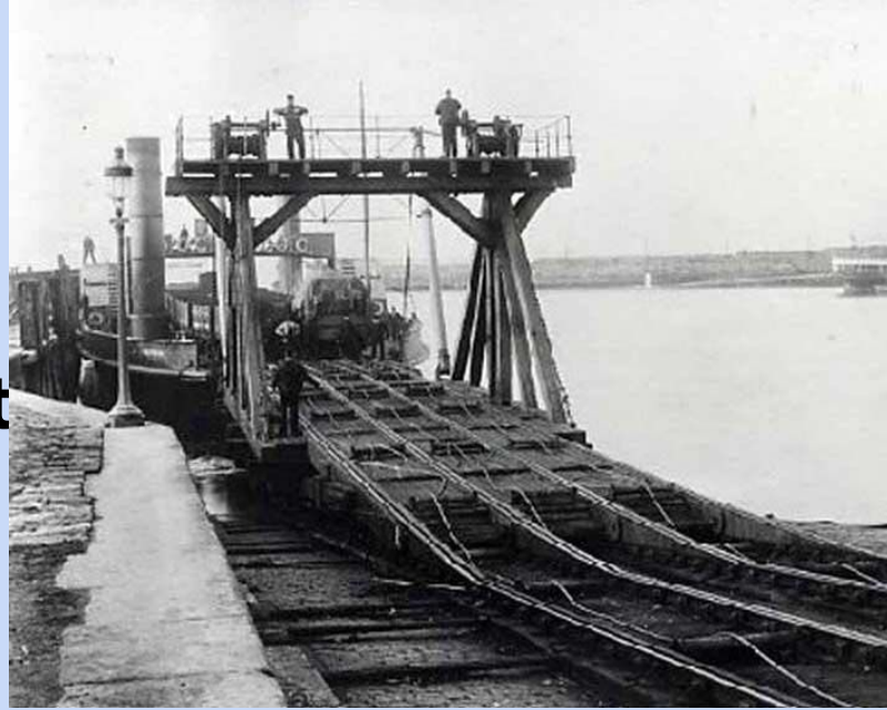
The Granton-Burntisland Rail Ferry pictured in the 1880s.

In 1865, shortly after Carlton began life in 1863, they were invited to play Cupar CC. This was the club's first fixture out of Edinburgh. Nowadays such a fixture would involve nothing more difficult than a drive up the M90 and A92 - about an hour's journey. Car-sickness might be an issue, but not there would be no likelihood of sea-sickness. But in 1865 an away fixtures of this sort were a little more challenging.