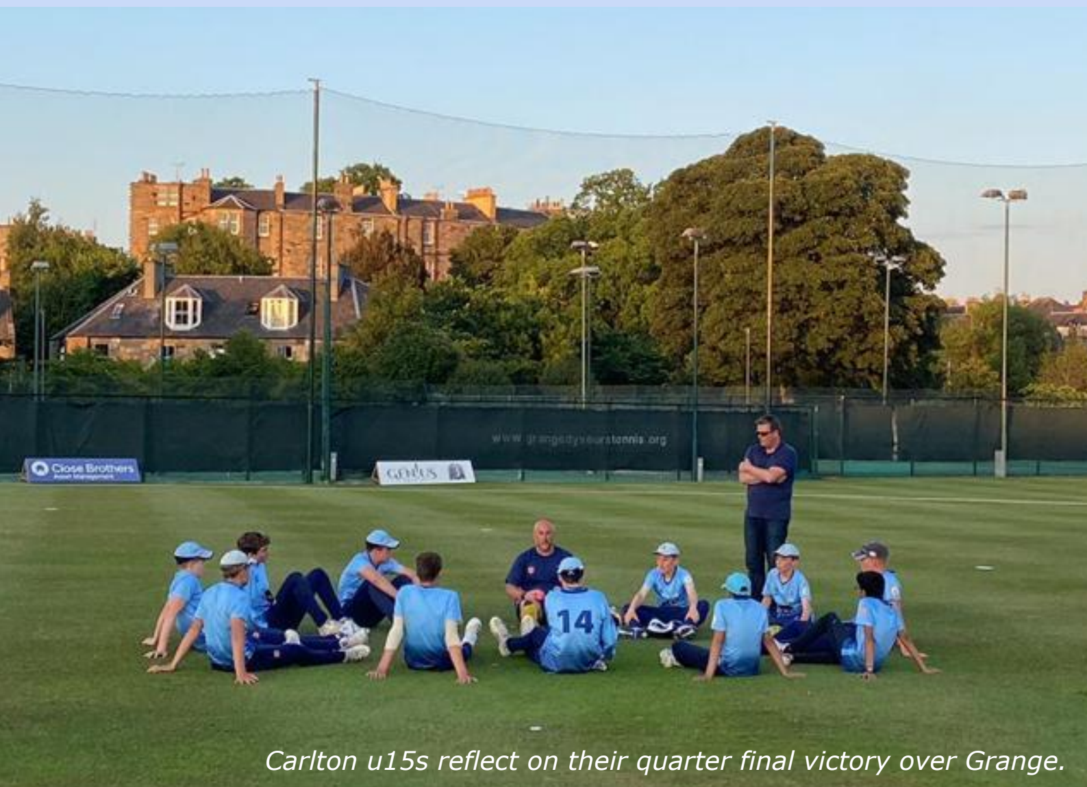
Carlton u15s reflect on their quarter final victory over Grange.

Sat 26 August - Senior End of Season Dinner - full details to follow