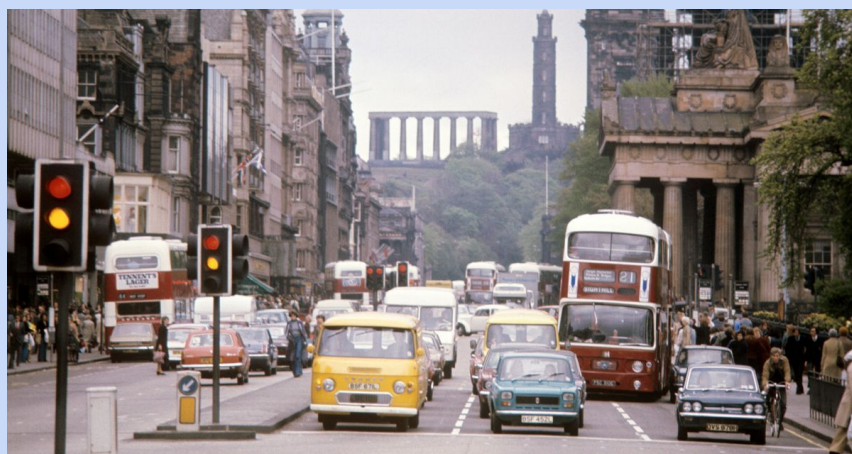
Princess Street in 1973

On Tuesdays and Thursdays during June and July, Grange Loan was used by Edinburgh Ladies Archery Club for practice, an arrangement that had existed for many years and continued to the late 1970s.