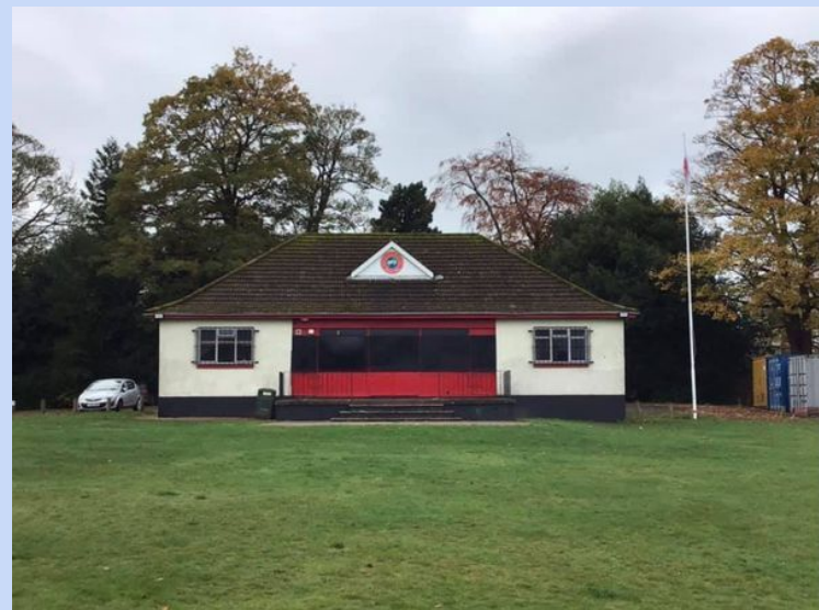
The pavilion at Duffus Park Cupar - home to Cupar CC from 1920.