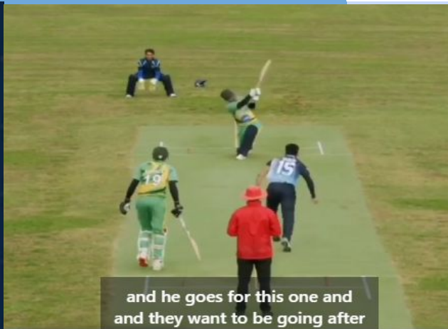
and he goes for this one and they want to be going after

See the big hitting of Brescia's batsmen as they secure qualification for the ECL.