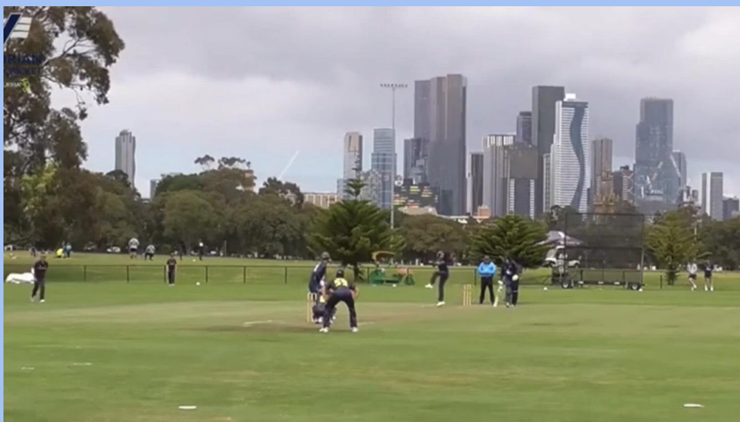
Tom faces up with the Melbourne cityscape as a backdrop

The training has a really good intensity, with a culture that assumes everyone will train week in week out regardless of what team they are in/seniority within the club. Similarly, we train Tuesday-Thursday at a slightly earlier time of 5.30-7.30, however, most people (especially batters) will likely be down for hits early and often stay on after training.