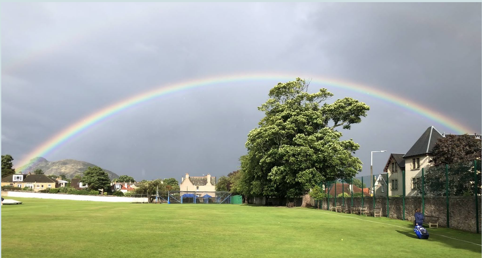
Rainbow at Grange Loan 13 August 2021