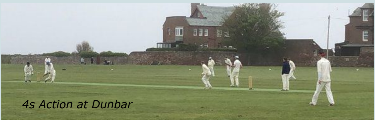
4s Action at Dunbar