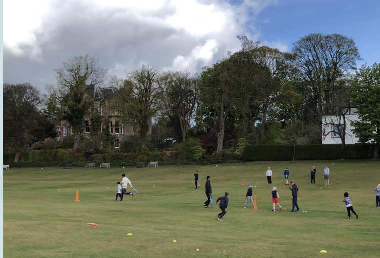
Action from the recent Players v Parents tussle.

Many thanks, as always, to all junior coaches, managers and helpers!