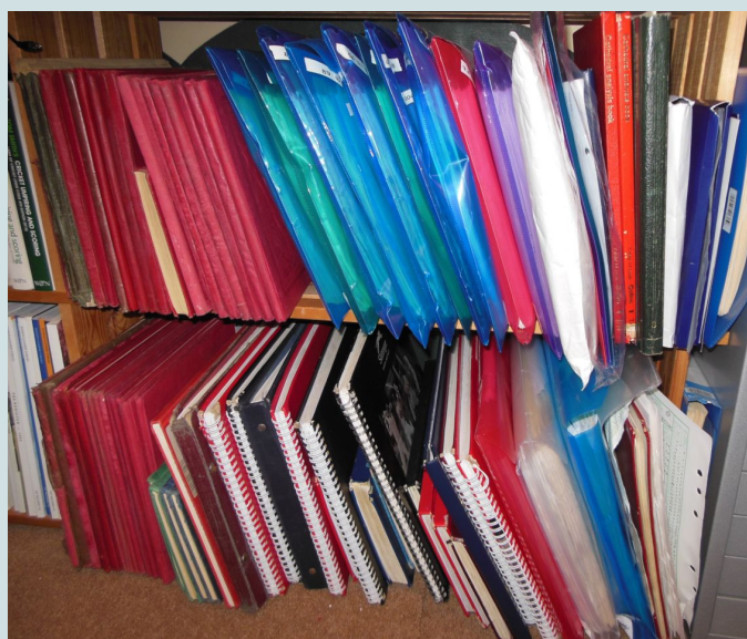
The raw data