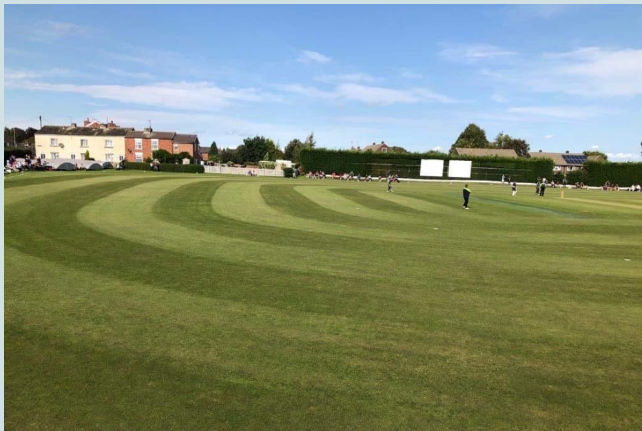
Carlton CC Ground at Rothwell Wakefield

We asked our namesake club in Yorkshire how was their 2020 season